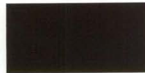
UC50927 Commerce Brown

Exotic Colors: These colors carry a surcharge due to their exotic pigmentation; therefore, premium pricing is applicable. Certain exotic colors may also require a barrier coat and/or the XL clear coat.