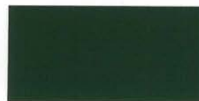
UC51733 Hartford Green