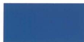
UC52064 Arabian Blue