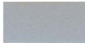
UC70202F Champagne Bronze