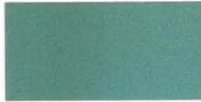
UC52274 XL Medium Green Metallic