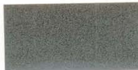
UC51227 XL Light Bronze #311