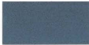
UC52061 XL Concord Blue