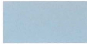
UC51594 XL Light Blue