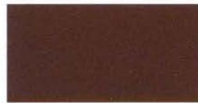
UC52179 XL Bronze