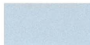
UC55028 XL/BC Bright Silver