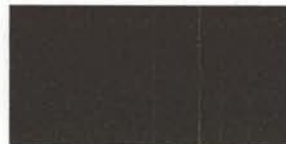
UC51515 XL Medium Bronze #312