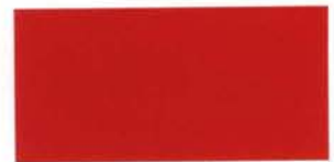
UC45282 XL Red