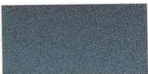
UC70214F Gray Velvet