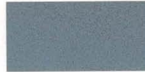
UC51595 XL Medium Gray