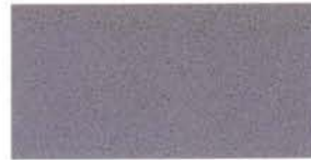
UC59072 XL Rose Metallic