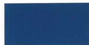
UC50014 Interstate Blue