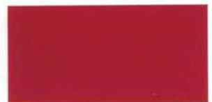
UC40597 XL Banner Red

Exotic Colors: These colors carry a surcharge due to their exotic pigmentation; therefore, premium pricing is applicable. Certain exotic colors may also require a barrier coat and/or the XL clear coat.