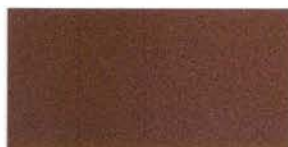
UC52113 XL/BC Bright Copper