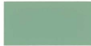
UC54434 Aged Copper