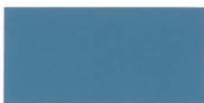
UC43359 Colonial Blue