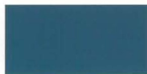
UC52128 Cherokee Blue