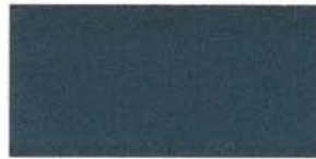
UC52002 XL Midnight Blue Metallic