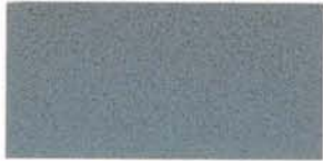
UC51713 XL Pewter