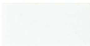
UC43350 Bone White