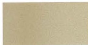
UC52138 XL/BC Gold