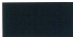
UC51704 Night Horizon Blue