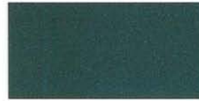
UC52188 XL Dark Green Metallic